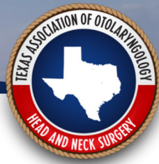
Exhibit Booth Details

Reminder: A single display table is $2,500